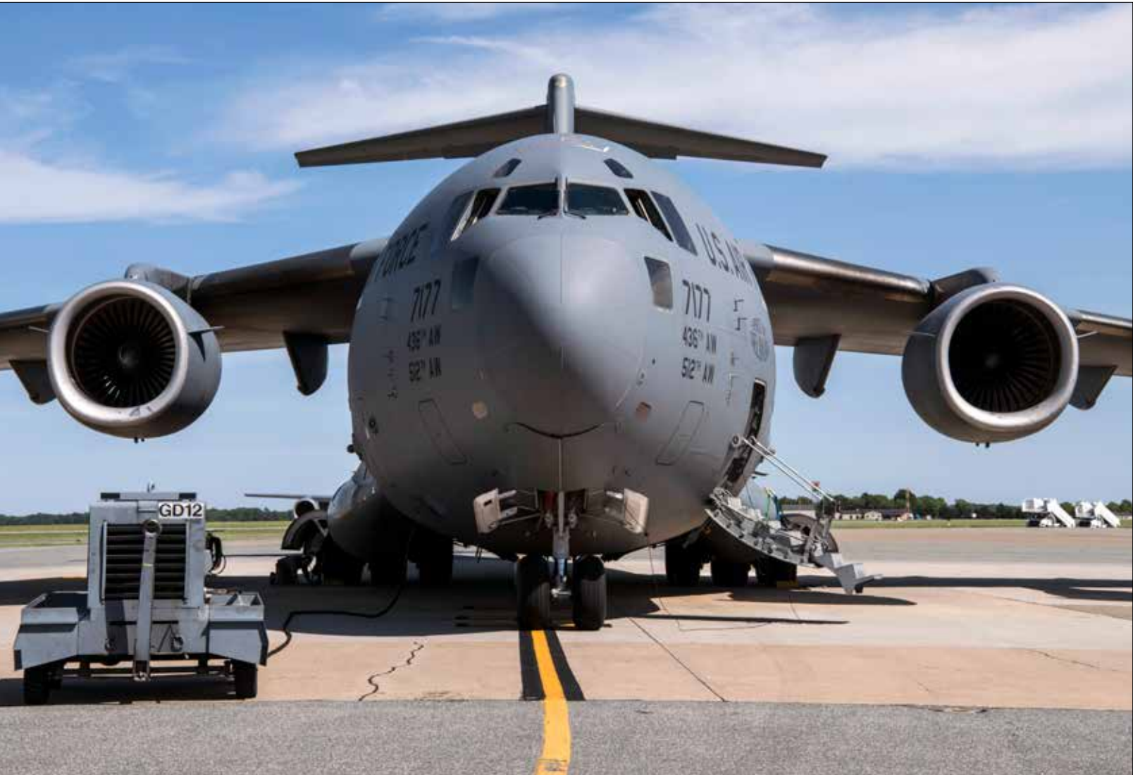
A C-17 Globemaster III sits on the flight line at Dover Air Force Base, DE. The 436th Airlift Wing at Dover houses, maintains and operates the C-5M Super Galaxy and C-17 Globemaster III.

The Boeing C-17 Globemaster III military airlift aircraft is a high-wing, four-engine, T-tailed military transport vehicle capable of carrying payloads up to 169,000lb (76,657kg). It has an international range and the ability to land on small airfields. A fully integrated electronic cockpit and advanced cargo system allows a crew of three (the pilot, co-pilot and loadmaster) to operate all systems on any type of mission.