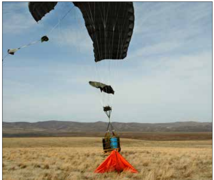
Airmen from the 62nd Airlift Wing successfully completed the first continental C-17 Globemaster III Joint Precision Airdrop System, or JPADS, airdrop during routine training by dropping two bundles equaling 2,900 pounds at Yakima Training Center, WA.

Whether their dropping beans or bullets, mobility airmen have always faced uncertainty with precision airdrops. Oftentimes, aircrews only get one pass to make a drop, and there's a lot that can go wrong. They must consider wind velocity, air pressure, payload mass and parachute drag, all of which can make or break an airdrop mission. Thus, CAT development efforts will reduce