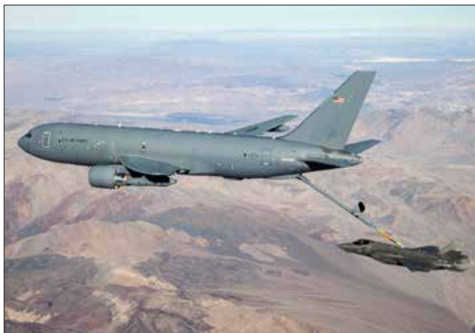
The KC-46 Pegasus and F-35A Lightning II are among the U.S. military's top weapon system acquisition programs. The aircraft will be major contributors to joint warfighting readiness for decades to come. The Air Logistics Complexes located at Tinker AFB, OK and Hill AFB, UT will perform programmed depot maintenance for the KC-46 and F-35A respectively.

have started construction on new hangar facilities and are acquiring the equipment we'll need to sustain this fleet throughout its life cycle.