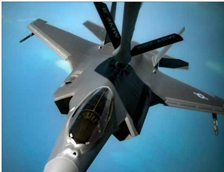
An F-35A Lightning II receives fuel from a KC-135R Stratotanker from the 28th Expeditionary Air Refueling Squadron. The 28th EARS maintains a 24/7 presence in the U.S. Central Command area of responsibility, supporting U.S. and Coalition aircraft in various operations in countries such as Iraq, Syria and Afghanistan.

By Col. Phillip Noltemeyer, U.S. Air Force Petroleum Office