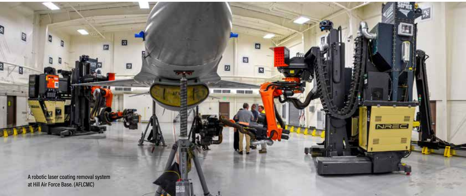
A robotic laser coating removal system at Hill Air Force Base.