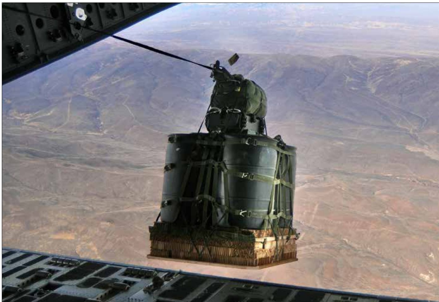
Airmen from the 62nd Airlift Wing successfully completed the first continental C-17 Globemaster III Joint Precision Airdrop System, or JPADS, airdrop during routine training by dropping two bundles equaling 2,900 pounds at Yakima Training Center, WA. Traditional airdrops by Air Force airlifters are at altitudes of anywhere between 400 and 1,000 feet. With JPADS, aircraft have the potential to guide air drop bundles from as high as 25,000 feet.

caused by flight tasks in the cockpit, so aircrews can concentrate on the mission at hand.