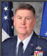
Lt. Gen. Gene Kirkland Commander Air Force Sustainment Center Tinker AFB, OK