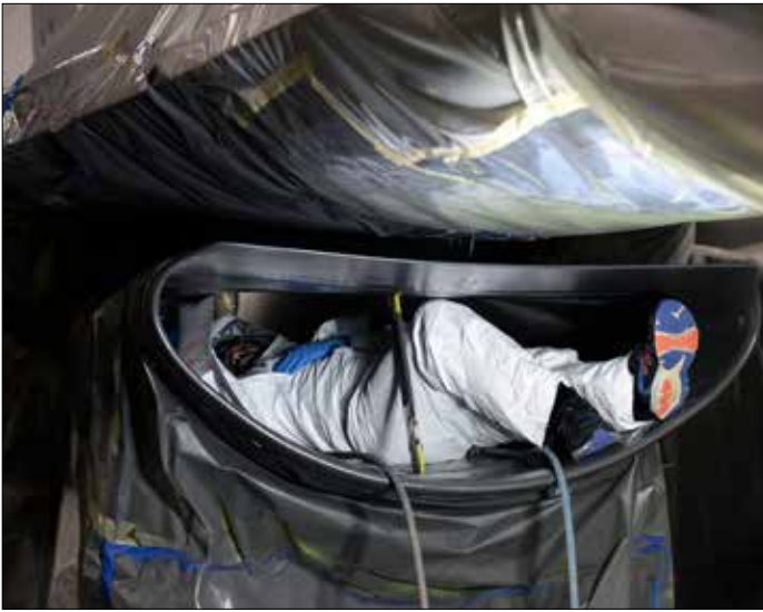
A 309th Maintenance Group corrosion control technician sands down the inside of an F-16 engine nacelle during the repainting of the aircraft at the Ogden Air Logistics Complex at Hill Air Force Base, UT. (AFSC)